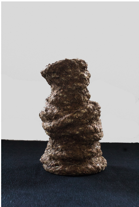
<Bio; O- infinitas> price; 150 euro Work one. threads, bio-glue, and leaves