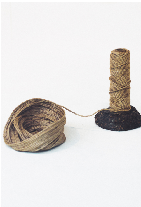
<Bio; O- infinitas> price; 250 euro Work six. threads, bio-glue, and leaves

Xuanlin Wang worked on the natural material and made the relationship with the human body for discussing the environmental issues, meanwhile, questioning the balance between environment and art. Bio-system is a material system created by Xuanlin Wang. In this system, 100% of the material resources came from nature and it could return to nature, like a natural ecological cycle. "Temporary" is the essence and belief in this system. She is devoted to present beauty in an ephemeral way instead of perennial.