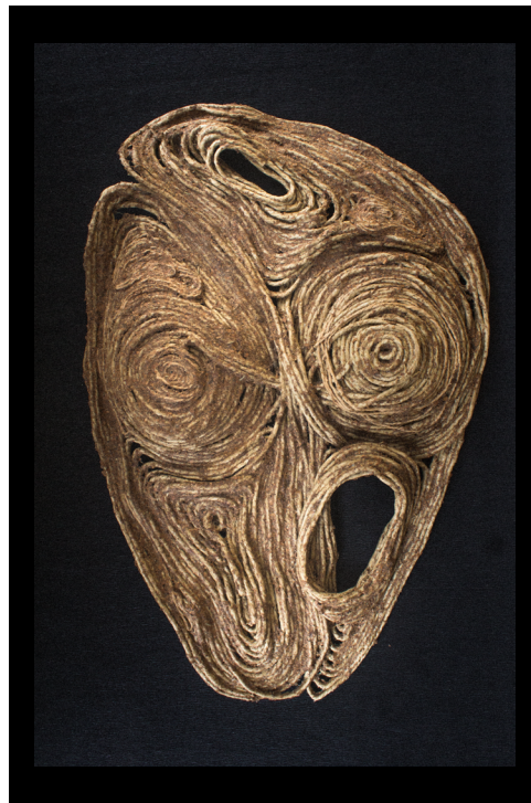
<Bio; O- infinitas> price; 400 euro Work three. threads, bio-glue, and leaves