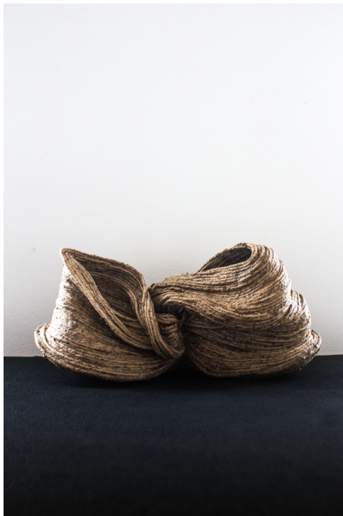
<Bio; O- infinitas> price; 350 euro Work two. threads, bio-glue, and leaves