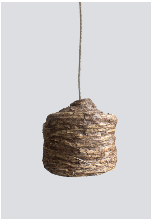
<Bio; O- infinitas> price; 350 euro Work five. Lamp. grass, bio-glue, and leaves